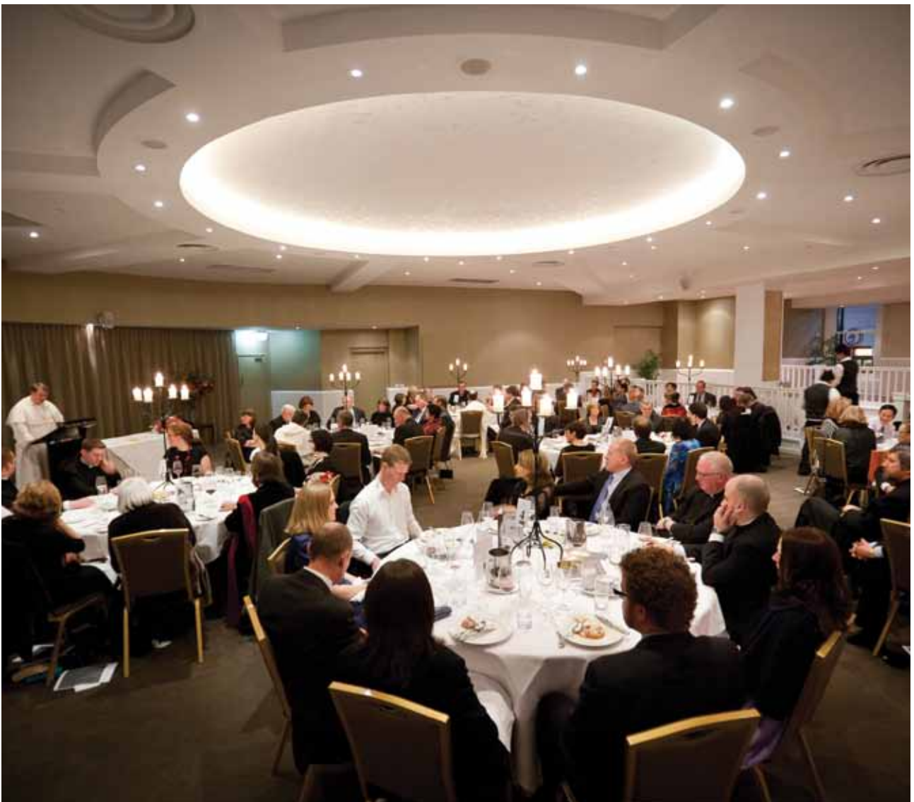
John Paul II Institute 10 th Anniversary Academic Dinner, July 2011.

Associate Dean and Head of Bioethics Fellow Research Fellow Chair, Committee on Commercialisation of Human Tissue Founding Executive Secretary Founding Member of Governing Council