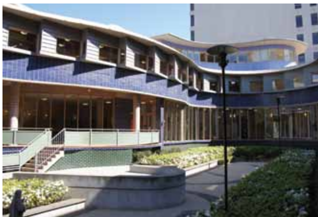
John Paul II Institute, the courtyard of Thomas Carr Centre, East Melbourne