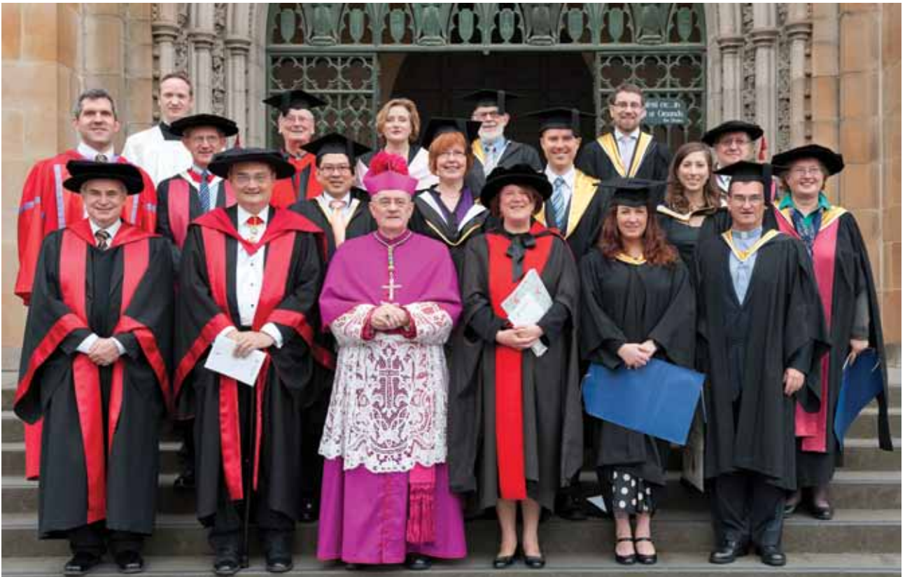
John Paul II Institute Faculty and Graduates outside St Patrick Cathedral, Melbourne, Graduation Day 2011.