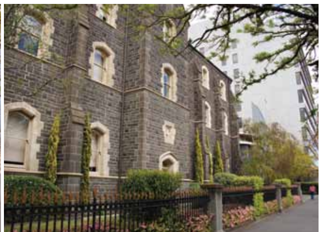
John Paul II Institute, Thomas Carr Centre, East Melbourne.